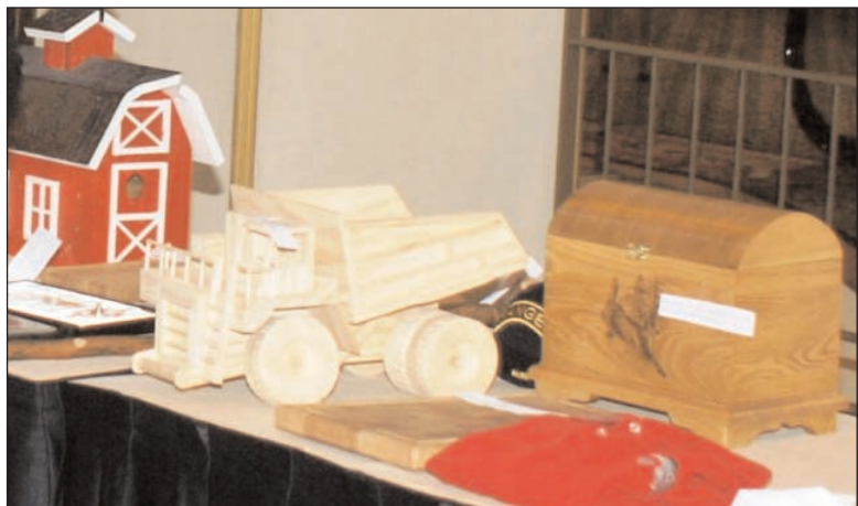
The Silent Auction drew handmade and local items from all over the U.S. and Canada. We raised $3800.