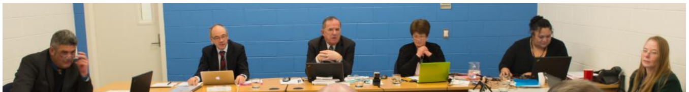
New Zealand Parole Board conducting a hearing

The Parole Act 2002 requires the Board to consider cases where offenders are eligible for release on parole, compassionate release, and release at their statutory or final release date. It also considers cases where, either the Department of Corrections or police, have applied to have an offender released on parole, recalled to prison. An offender released on parole can have their progress monitored by the Board.