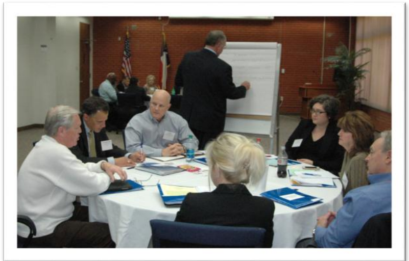
Workshop participants gather in small group sessions to exchange ideas.